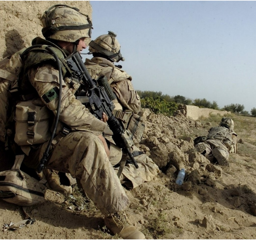
Canadian forces in Afghanistan