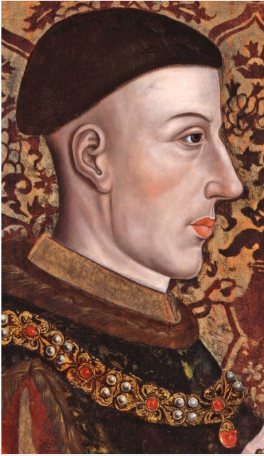
King Henry V of England