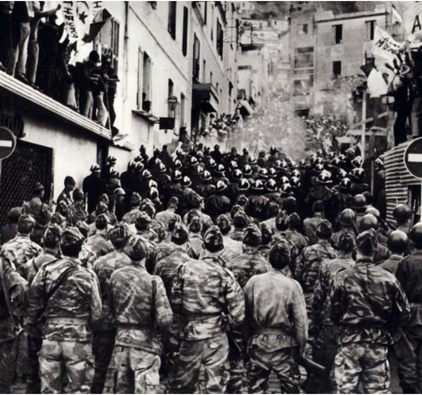
The Battle of Algiers (movie), 1966