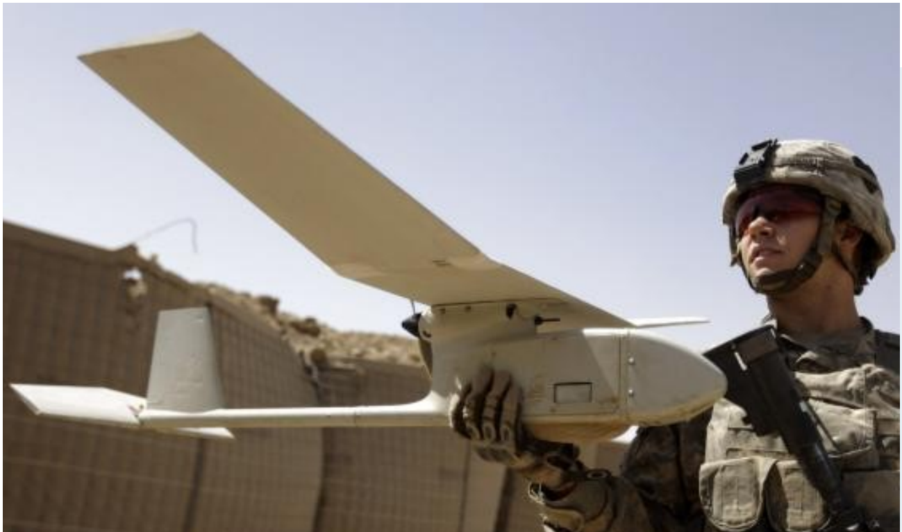
A U.S. Army soldier prepares to launch a drone , Afghanistan, 2010.