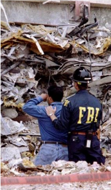
Oklahoma City, 1995