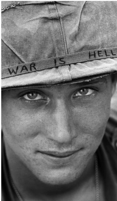
US soldier, Vietnam, 1965