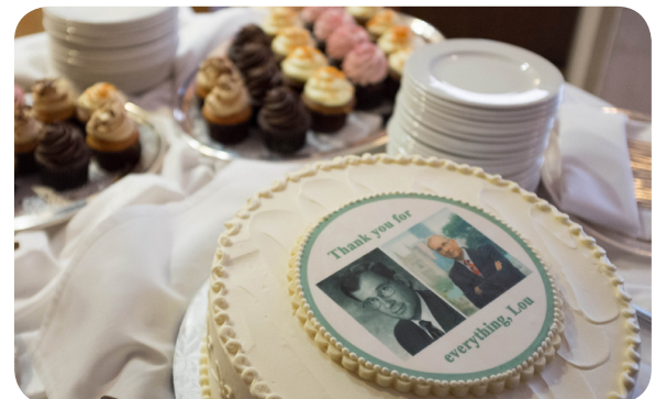
All things sweet at the Chair's farewell party.