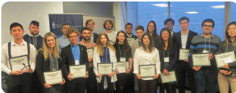
Recipients of undergraduate awards at this year's celebration.