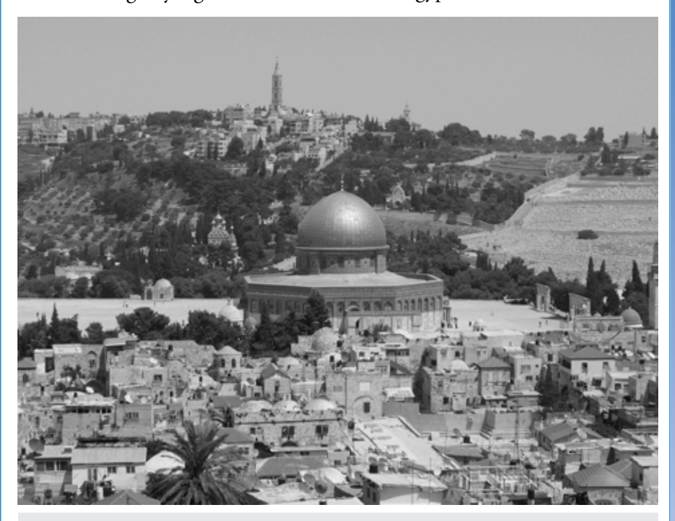
Jerusalem Old City

A third approach entails preventing migrants from crossing the Sinai border in the first place. This has included pressure on the Egyptian authorities who,