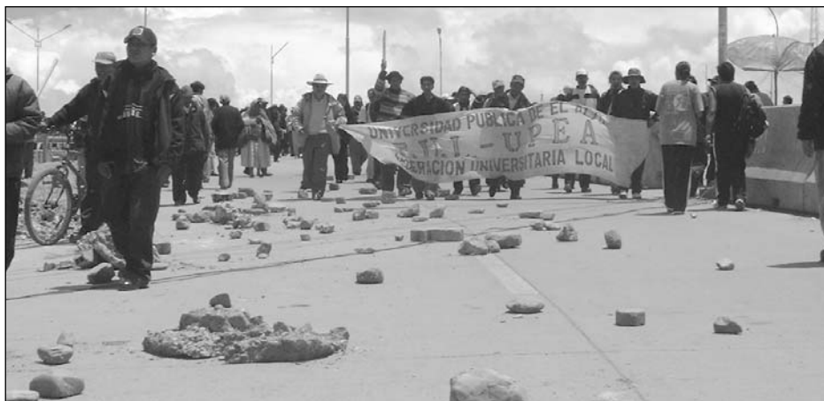
Revolutionary times in Bolivia

The revolutionary cycle brought together the Twentieth Century Bolivian traditions of revolutionary Marxism (primarily from the tin mines), indigenous nationalism (mostly from the Aymara altiplano ), and left Bolivian nationalism. Popular control of natural resources (natural gas and water), land and territorial integrity for indigenous nations within the Bolivian state, an end to neoliberal capitalism, anti-imperialism (mostly against the United States, the World Bank, and the International Monetary Fund), and a Constituent Assembly to remake the state in the name of, and